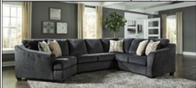
Eltmann Sectional $2499.99