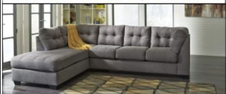
Maier Sectional $1699.99