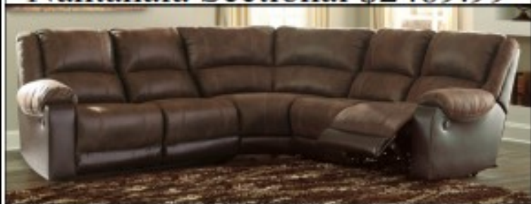
Nantahala Sectional $2489.99