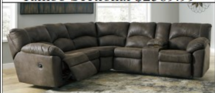
Tambo Sectional $2589.99