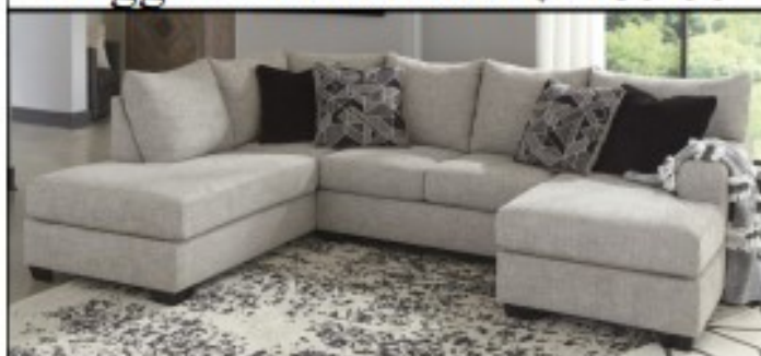
Megginson Sectional $2139.99