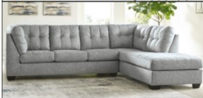
Falkirk Sectional $1659.99