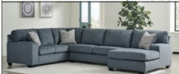
Ballinasloe Sectional $2229.99